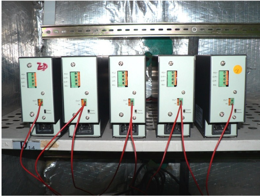
Figure 3 Setting of Master and Slave connections at the rear panels of 5 units of SSP-7080 modular power supplies

Remarks : When the output current in the Master & Slave connection drops to zero ampere, the output voltage will no longer be controlled by the Master unit.