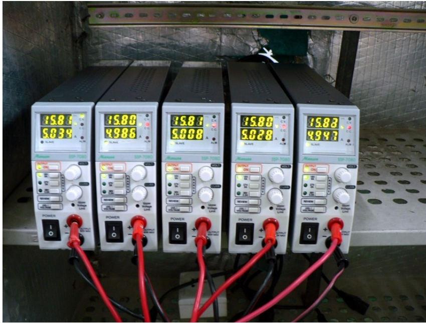
Figure 1 Front panel of Multi-VI range, scalable power supply SSP-7080 in action. All units have been set with the same VI range (16V, 5A) as shown on the indicators.

The sustainable and modular design concept of SSP-7080 allows of up to 5 units to be connected in parallel to give 5 times max. current. Before connecting, set all the units to the same UVL (Upper Voltage Limit ) and same VI range. Then set the voltage and current limit of all the Slave units to maximum values. (See Figure 1)